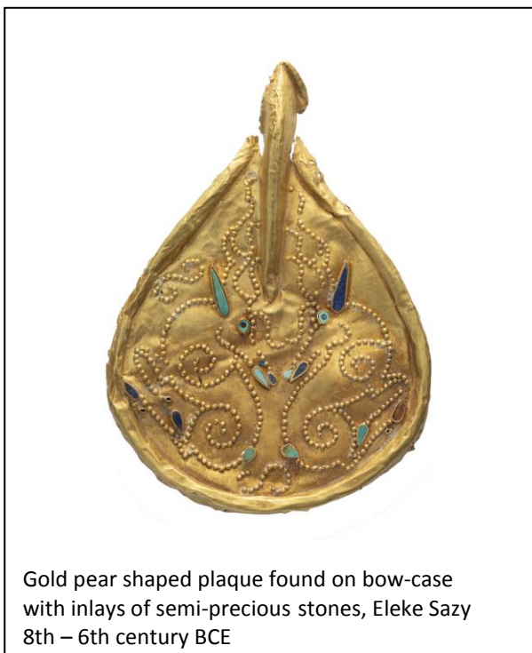
Gold pear shaped plaque found on bow-case with inlays of semi-precious stones, Eleke Sazy 8th – 6th century BCE

The unearthed artefacts have revealed the Saka as a distinctive, complex society, with immense skill, who used an advanced understanding of design, intricate engineering, and technology to produce wonderful artefacts such as thousands of decorative gold micro-beads, just 1 millimetre in diameter, to be sewn onto clothing and sophisticated weapon-belt attachments that were hinged to absorb the movement of weaponry while in motion on horseback.