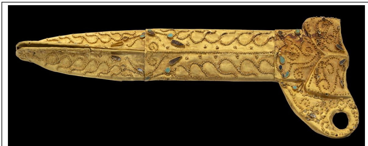
Gold scabbard for a dagger with turquoise and lapis lazuli inlay, Eleke Sazy 8th – 6th century BCE

Gold of The Great Steppe (28 September 2021 – 30 January 2022) will display an archaeological sensation, hundreds of outstanding gold artefacts recently discovered in the extraordinary ancient burial mounds built by the Saka people in East Kazakhstan.